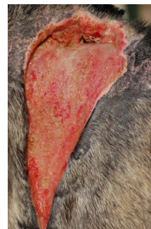
Neck left, 3/7/2009