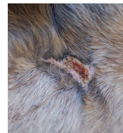
Neck right, 24/8/2009