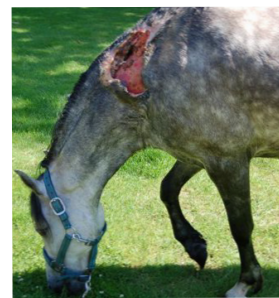
Neck left, 24/6/2009