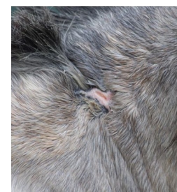
Neck right, 31/8/2009