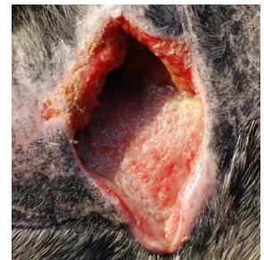
Neck right, 3/7/2009