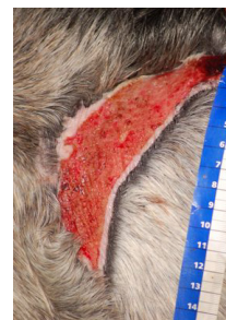
Neck left, 24/8/2009