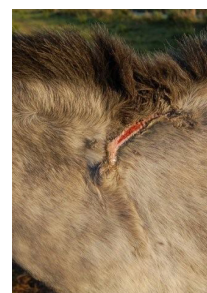
Neck left, 3/10/2009